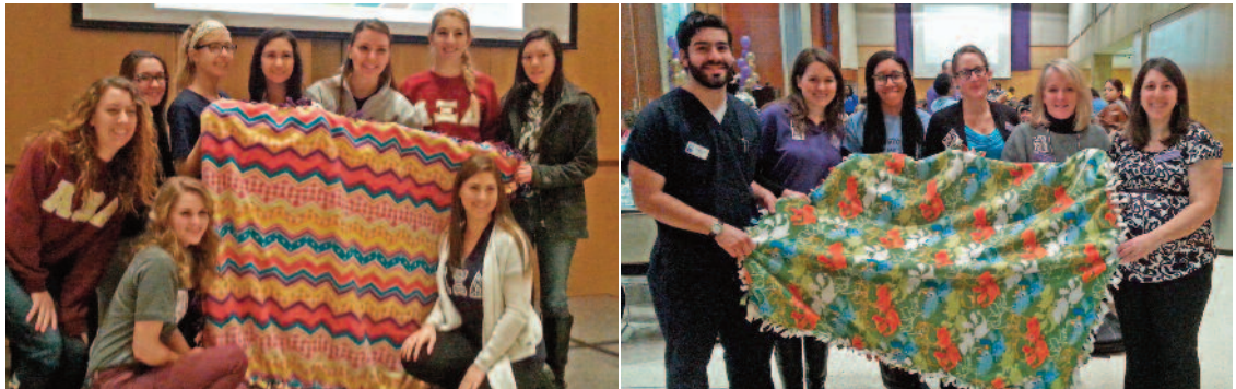
Small groups worked together to create colorful, comforting fleece blankets

Kindergartners, seniors, and every age in-between – especially WCU college students -- filled a ballroom at Sykes Student Union Jan. 22 to honor Dr. Martin Luther King, Jr.'s legacy by providing service to others.