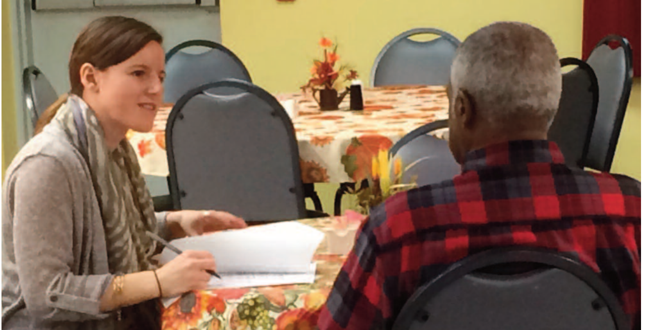
WCU students worked 1-1 with older adults at Coatesville Area Senior Center

According to the Centers for Disease Control and Prevention, nearly one-third of older adults in the U.S. experience a fall each year. Falls can be devastating — about one in 10 falls among older adults result in serious injury. And falls can be deadly — they're the leading cause of injury deaths among older adults.