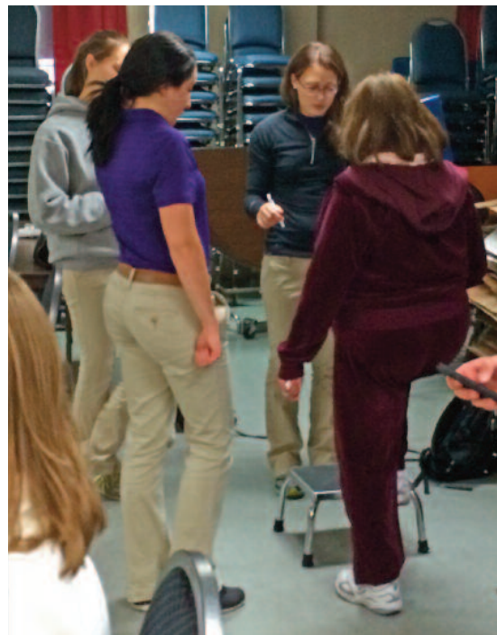
Strength and balance training were part of the falls prevention program

The fall prevention program is being presented again this semester, at a new location, the West Chester Area Senior Center.