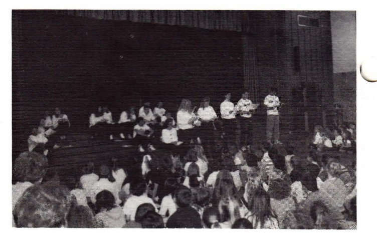
Five Advanced Communications Skills juniors do a Readers' Theater enterpretation of "The Frog Prince."

What these and many similar experiences have shown me is that, like a one-room schoolhouse or a family or a business or a faculty, cross-generational (or cross-curriculum) projects benefit from different points of view. More importantly, I re-learned that learning must not always be competitive, judged by a standardized test, but needs to be cooperative, judged by the success of the final product.