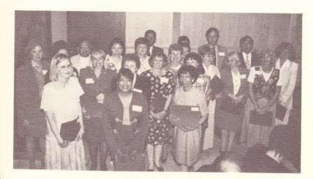
School administrators from six counties are honored at the 1996 Banquet as "Friends" of PAWP.