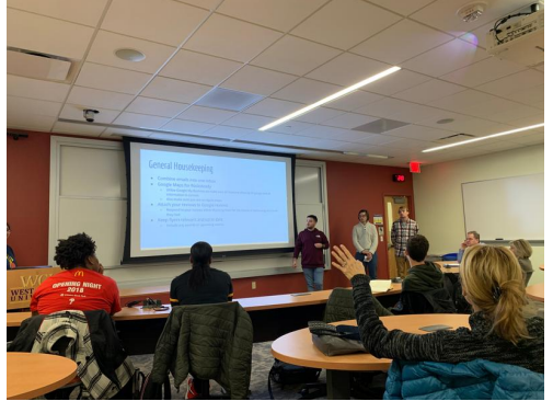
MKT 490, Fall 2019