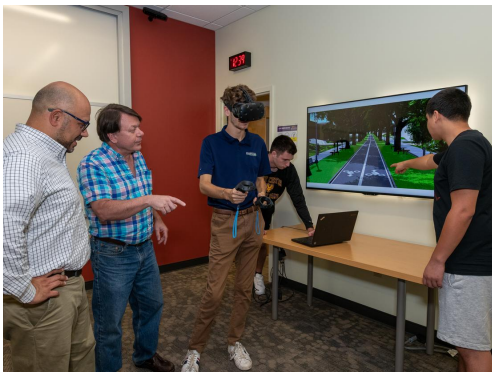
GIS and Spatial Analysis Center