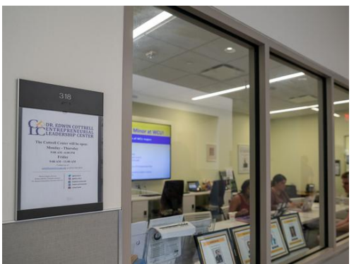
Cottrell Entrepreneurial Center

Thank you to the University's administration for their continued support of the Center for Community Solutions. We would also like to thank all of those across campus who collaborate with us in supporting the University's Strategic Plan. These prodigious opportunities serve to deepen community engagement and broaden the University's many contributions for the common good.